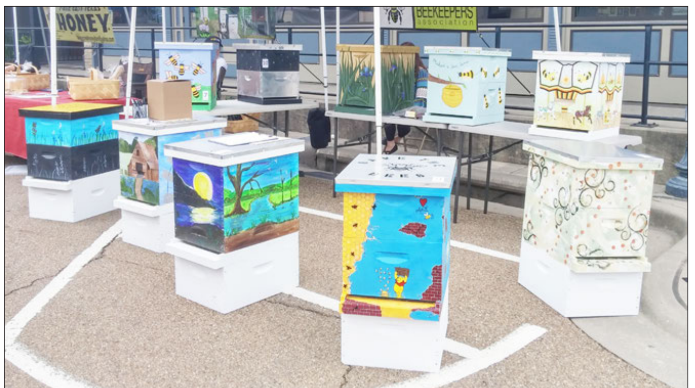
These are the hives which have been entered in the bee hive painting contest and they are currently on display at the Winnsboro Center for the Arts.

Honey bees directly pollinate a third of all the food we eat and their value to U.S. agriculture is more than $14 billion annually. The problem is that beekeepers are losing 35 to 50 percent of their