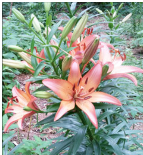
LA Hybrid lily 'Royal Sunset' blooms for weeks. RIGHT: Red blooms of canna invite hummingbirds to your garden