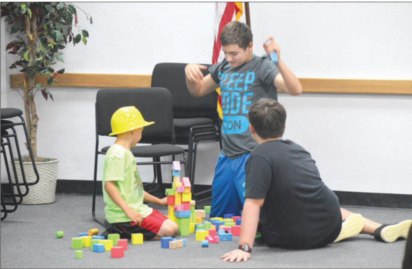
Quitman Public Library continues to have activities each Thursday afternoon for local area youth. It was "Build a Better Widget" day last week when this photo was taken.