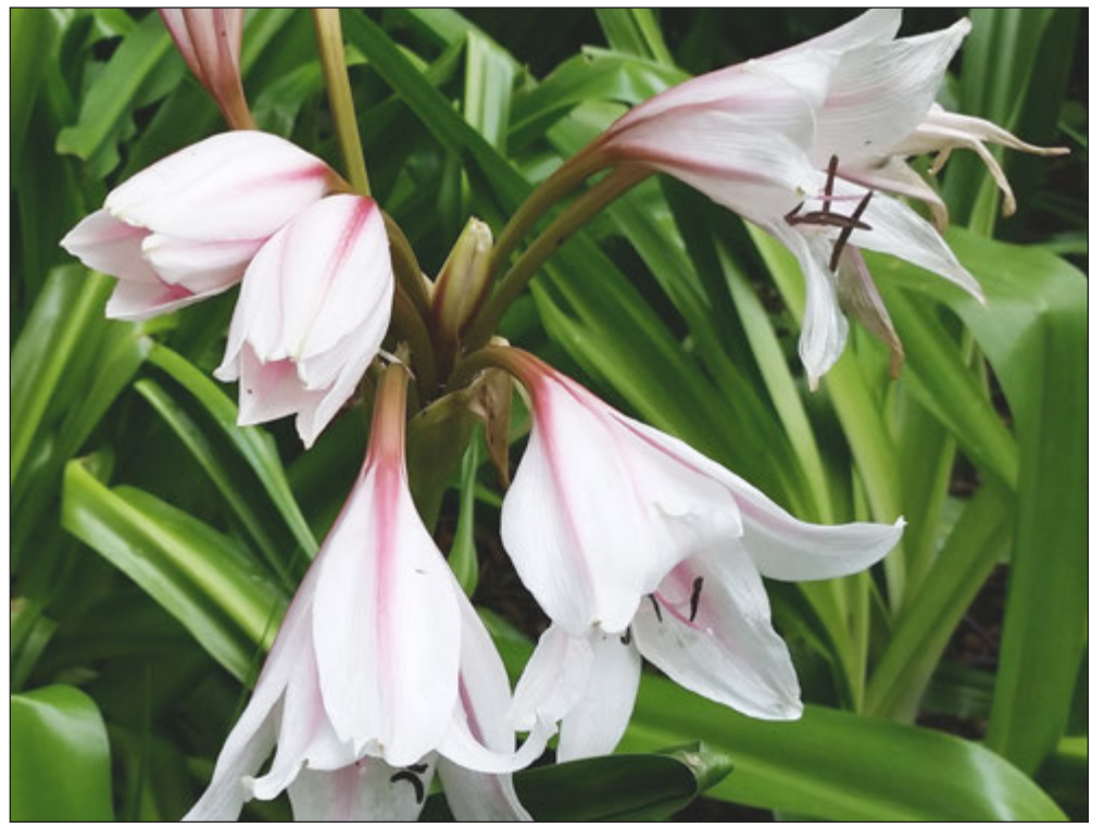
Milk and wine lilies are fragrant as well as beautiful.

Cannas are a good 'beginner' plant for a new garden – they'll grow and bloom all summer in even the poorest soils. They have large, tropical-looking leaves of light green,