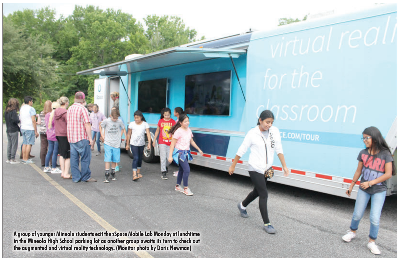
A group of younger Mineola students exit the zSpace Mobile Lab Monday at lunchtime in the Mineola High School parking lot as another group awaits its turn to check out the augmented and virtual reality technology.