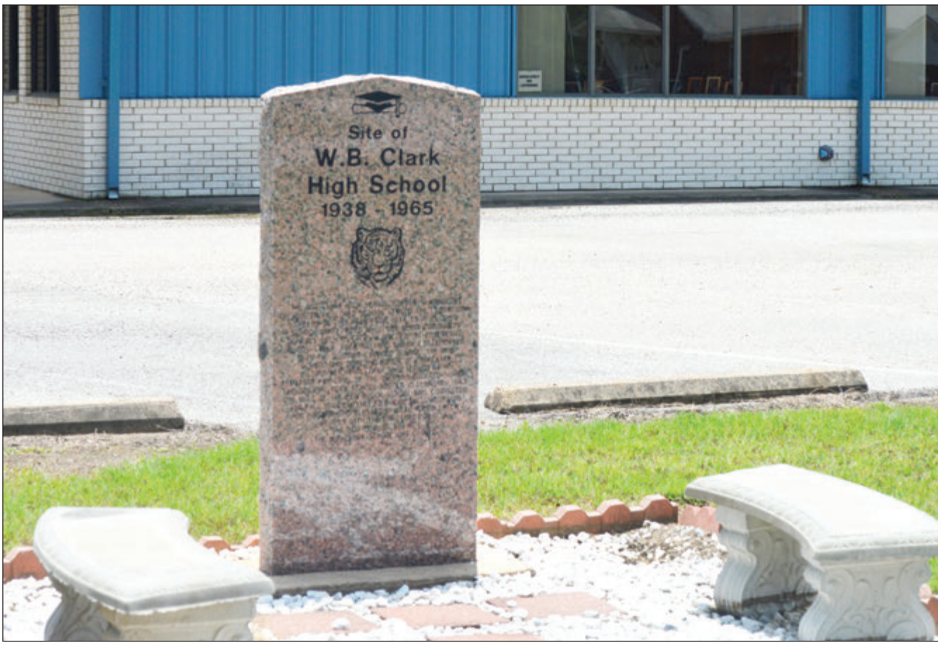
A monument stands on the grounds which formerly was the location of W.B. Clark School which served the African American community in Quitman and surrounding areas for over 30 years prior to integration.