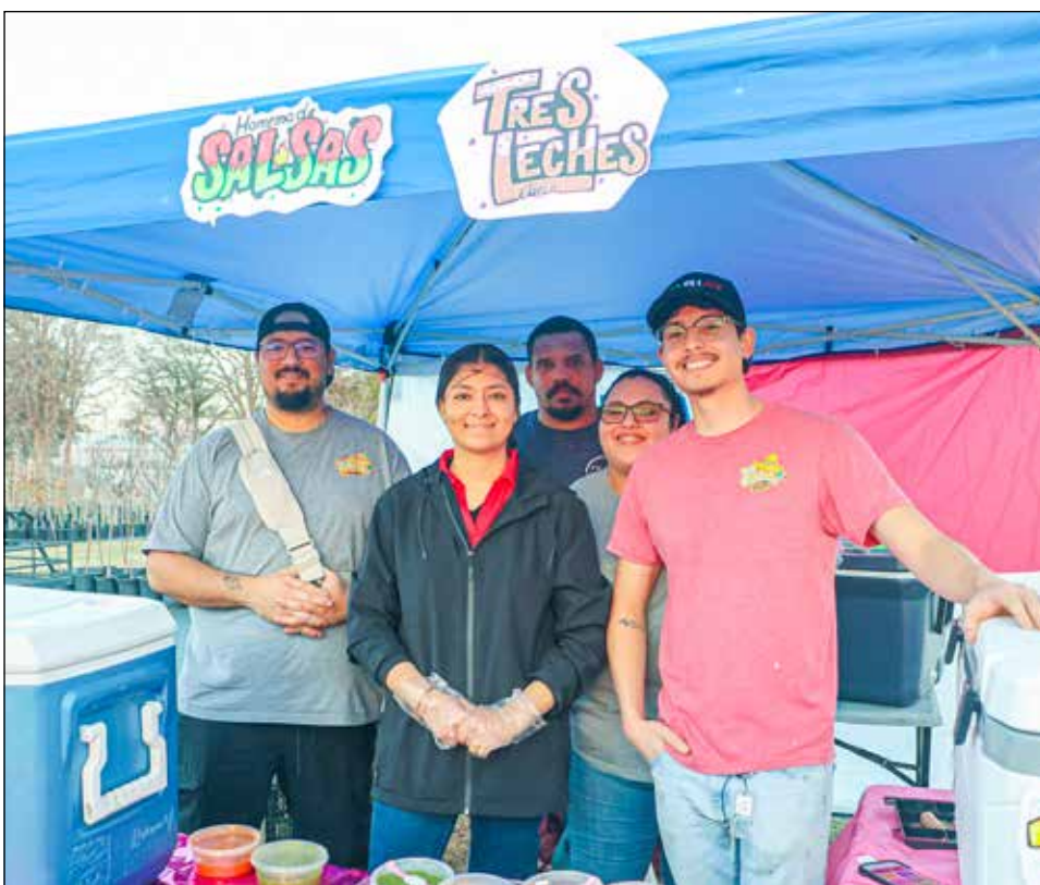
Mi Familia Market of Mineola offering handmade salsas.