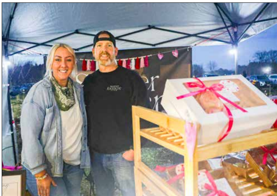
Seeber Fouracre Farm and baked goods of Lindale offer a variety of Valentine's-themed treats. Their sourdough bread sold out in the first hour of the market.