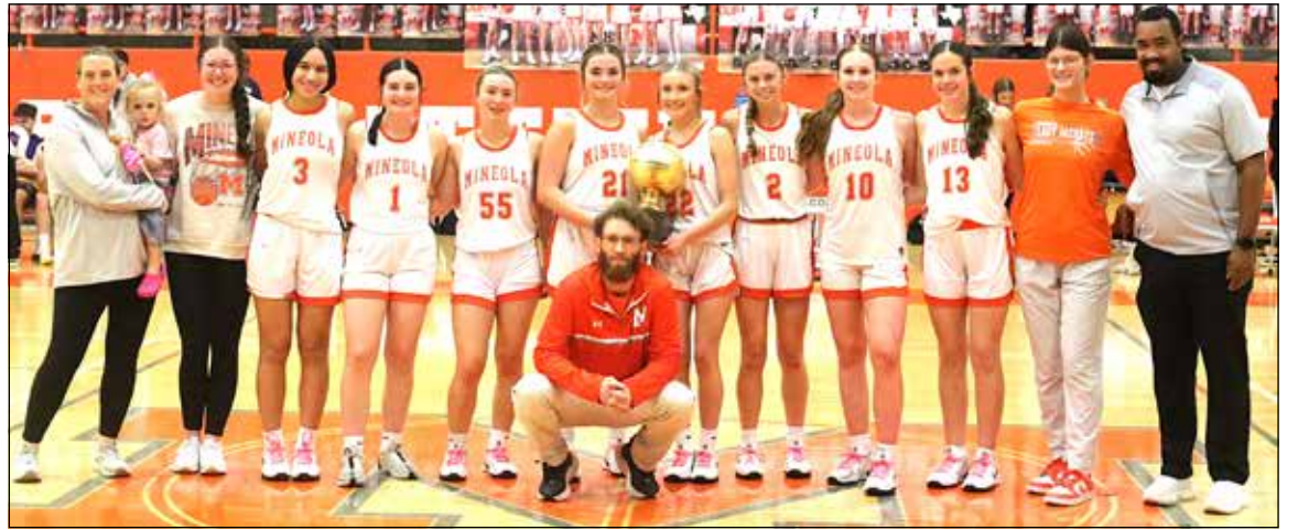
The 2025-26 Lady Jackets.