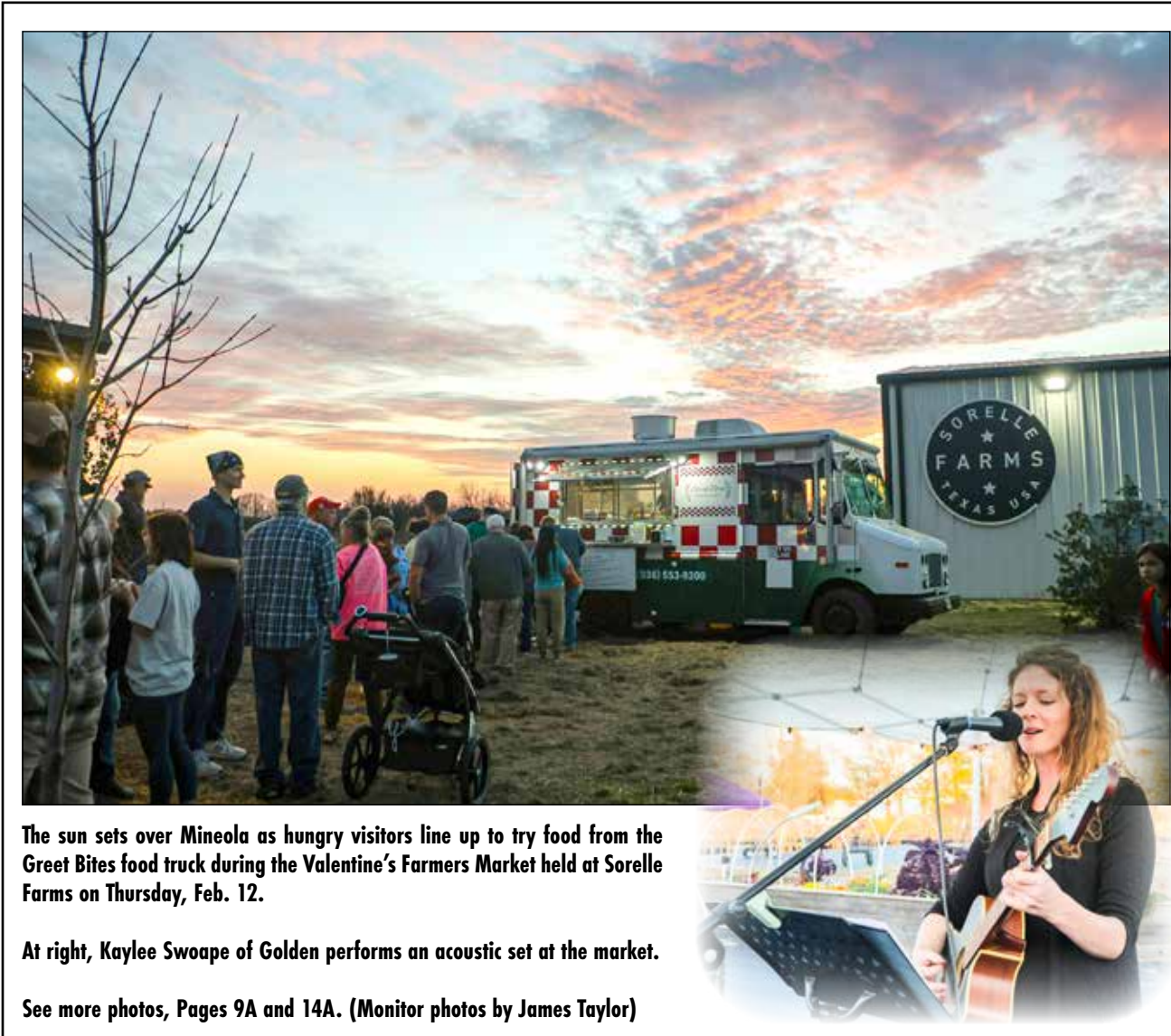
The sun sets over Mineola as hungry visitors line up to try food from the Greet Bites food truck during the Valentine's Farmers Market held at Sorelle Farms on Thursday, Feb. 12.

Two warrants for possession of controlled substance.