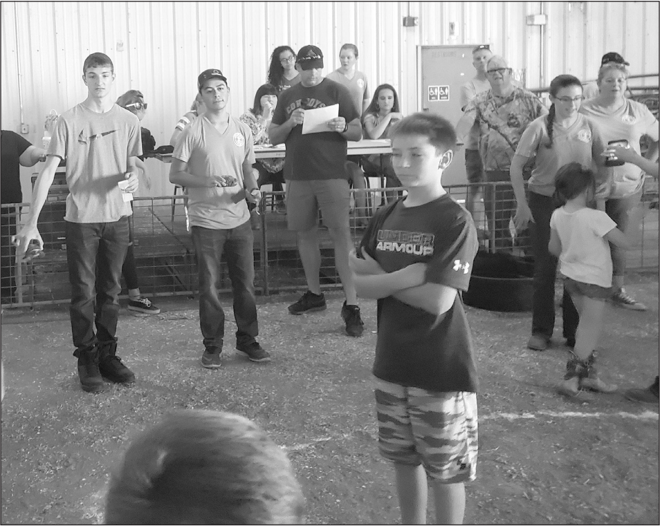
Altus Rotary Club Sponsoring the Turtle races at the Jackson County Free Fair.

SECTION 4307 BABYSITTING/CHILD CARE UNIT ONE (Grades 3-7) (For full details, see State Fair Book) 1. Baby Book 2. Puzzles Help Children Learn. Any size. Two (2) puzzles developmentally appropriate for children at two distinct age and ability levels. Each puzzle must have its own storage container. 3. Child Care Poster Must be 14" x 22". Illustrate techniques of positive guidance. 4. Basic First Aid Kit UNIT TWO (Grades 8-12) (For full details, see State Fair Book) 5. Children’s Book, Written and illustrated by