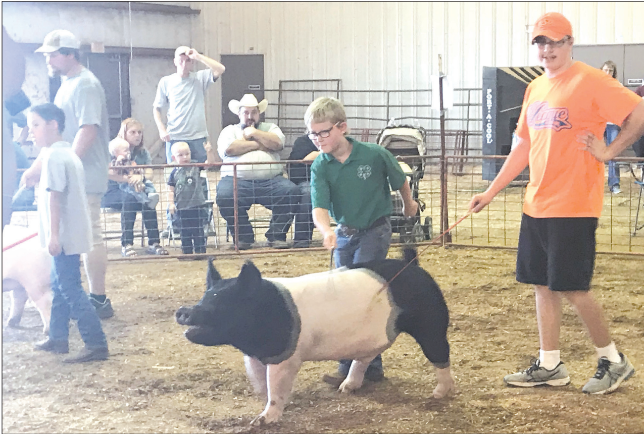
Special Olympic Swine Show at the Jackson County Free Fair.