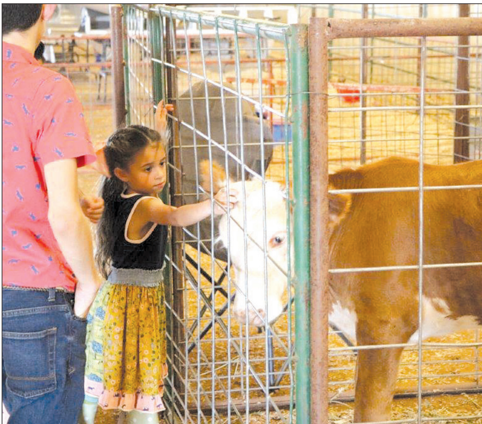
Kids Day at Jackson County Free Fair.