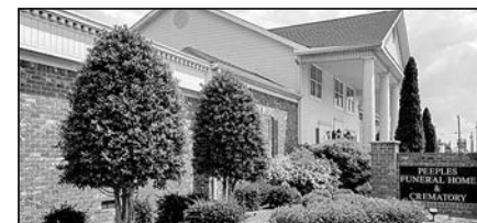
Family Owned and Operated