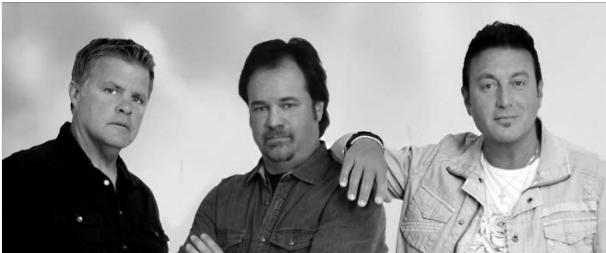
The Frontmen include (from left) Richie McDonald of Lonestar, Larry Stewart of Restless Heart and Tim Rushlow, formerly of Little Texas. They will perform from 3:30-5 p.m. on Sunday.