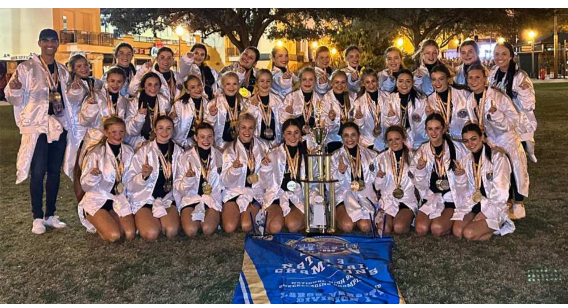
Pictured are members and coaches of the Live Oak High cheerleading squad after capturing first place in the Large Varsity Division I finals during the 2023 UCA National High School Cheerleading Championship held in Orlando, Florida, in February.

LIVE OAK HIGH CHEERLEADERS HONORED FOR SIXTH STRAIGHT CHAMPIONSHIP.