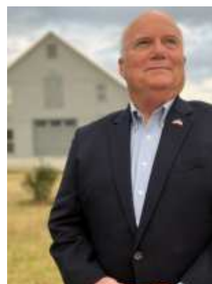
Second Amendment rights and is a staunch advocate of balancing the budget. He has more than 40 years of law enforcement experience and proven leadership. He managed the Ascension Parish Sheriff's Office for 23 years, oversee-