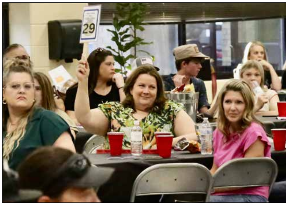
The Alba-Golden Young Farmers raised $25,000 for the Alba-Golden agricultural science program at the annual auction Saturday. The auction brought plenty of laughs and fellowship and highlighted some amazing items created by the ag-science students at Alba-Golden.