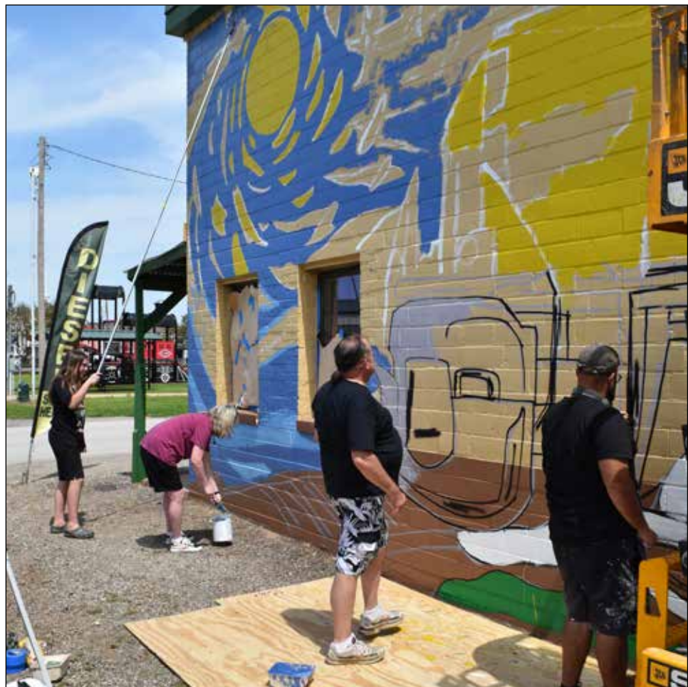
The Texas Street Art Festival kicked off across Wood County this week, including this community mural project at Eagle Oil Co. on Front St. in Mineola. Dedications will be held for the new murals on Saturday morning.

See Page 10A for complete stock show results.