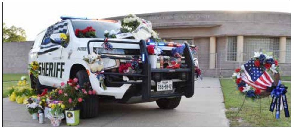
A Wood County sheriff's vehicle serves as a memorial in front of the sheriff's department in Quitman after Deputy Melissa Pollard was killed in a traffic crash April 9.